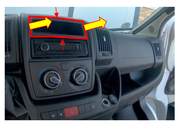
Mounting the amplifier

Remove the storage compartment above the radio.